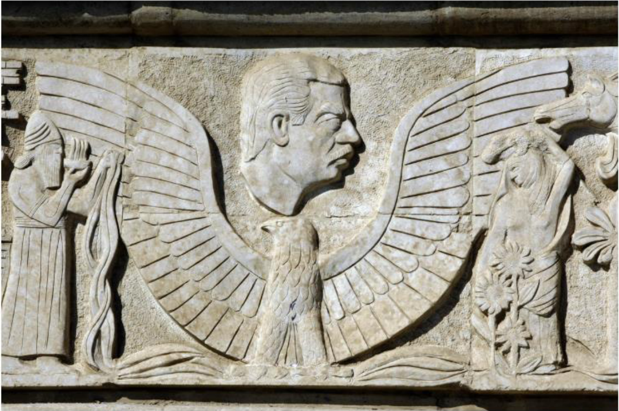
To fuel support for his war with Iran, Saddam turned increasingly turned to grand nationalist building projects like Babylon. Here, his face appears in a relief that imitates the style of ancient artworks.

When President Bush ordered U.S. forces to invade Iraq in 2003, they occupied Babylon and turned Saddam's castle into their command center. Their graffiti remains on the walls: notes of longing about faraway loved ones, reminders of soldierly protocol. The military also caused immense damage to the site, looting precious artifacts and running tanks over ancient ruins. Over 15 years after Saddam's fall from power, his palatial tribute to the emperor has become a ghostly shell. Broken glass and graffiti are scattered through the once-grand palace halls. Teenagers and families smoke shisha and listen to music on Saddam's vast balconies, overlooking the mind-boggling spread of Babylon.