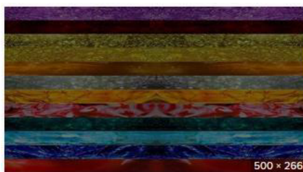
13 Foundations of New Jerusalem | New Jerusalem Di

Heaven is a colorful place. The New Jerusalem will have 12 layers of foundation stones that light can travel through.