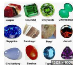
Christian Evidence The 12 Fou