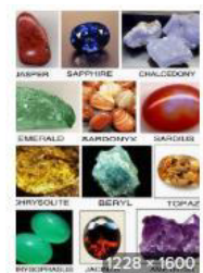
19 The foundations

Why did God have Ezekiel scatter the cherubim's fiery coals in Jerusalem? For starters, there is a lot of manmade trash to burn. Jerusalem had to become a burn barrel.