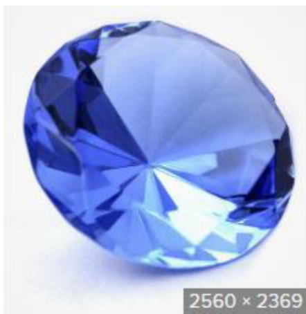
Blue Sapphire - Sadia Arsha...

There may be a transliteration adjustment needed for sapphire. God’s throne may not be light blue, like a sapphire. Sapphire was not discovered until the era of the Roman Empire. This same stone likeness is also translated elsewhere as Lapis Lazuli. Lapis Lazuli is one of the oldest mined substances known to man. It is a Persian word meaning ‘gem’. This reference has to be referring to Lapis Lazuli; meaning that the heavenly throne pavement is not light blue. It's a richer, more-intense dark blue.