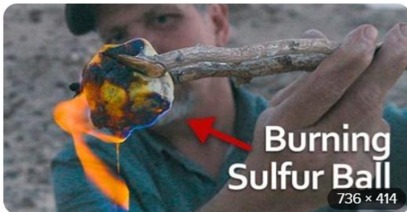
Sulfur Balls of Sodom and Gomorrah | Sodom and gomorr...

Read Ezekiel 38: 14-23: The invading Russian and Muslim coalition will be wiped out by God. He will rain down fire and brimstone, just like Sodom and Gomorrah.