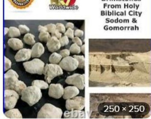
20 Pcs Authentic Brimstone Sulfu...

It will be a massive place of dead bodies that are unclean and need to be buried. It will take 7 months to bury the bodies.